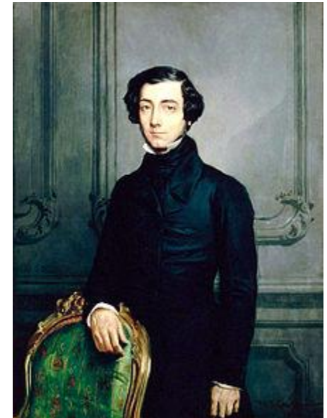
Alexis de Tocqueville 1805 - 1859

...a society where hard work was the dominant ethic, .... where commoners never deferred to elites