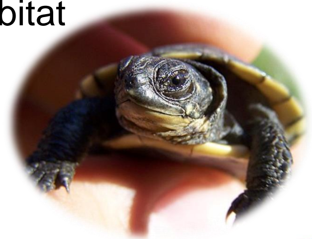
Blanding's Turtle (Threatened)