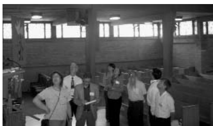
The 'green team' doing a simple walk-through energy audit at Newtonbrook United Church in Toronto.

The policies you choose to influence, and the ways you go about it, should be considered carefully by your Green Team, with an eye toward developing short, medium and long term plans to keep you focused. Local policy change can be as simple as convincing the people working in the administrative office to turn off their computers every night. Or it can be as challenging as persuading the congregation to include green criteria in their annual planning and budget-