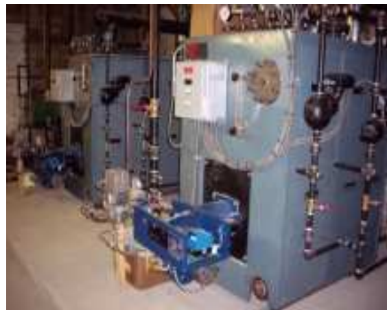
The new boiler at Melrose United is state of the art.

Memorable Moment: Well, actually, there were 2 of these. When we first turned on the solar panels ... and when we put the new, high efficiency boiler and found that we had reduced the cost of heating our building by 15%.