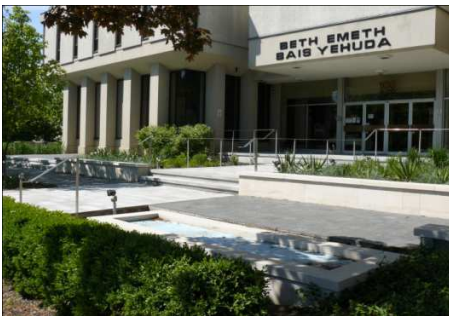
Beth Emeth Bais Yehuda Synagogue, Toronto