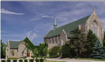
Islington United Church, Toronto