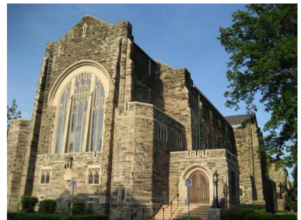
Melrose United Church, Hamilton