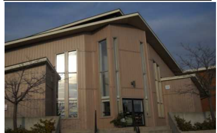
Erin Mills United Church, Halton-Peel